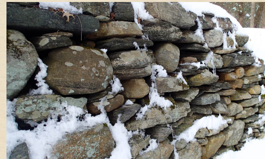
Lichen dots stones of Hammond Mill Dam remnants

If you have not taken in the unique beauty of a winter woodland, wetland, or open-space walk you are missing quite a treat. Forests of leafless trees allow for clear views to distant vistas. Snow cover and clear blue winter skies highlight the bark texture and branch structures of hardwood trees. Rock outcroppings and boulder fields hint at the geological past of our region, while old stone walls provide clues to past agricultural use.